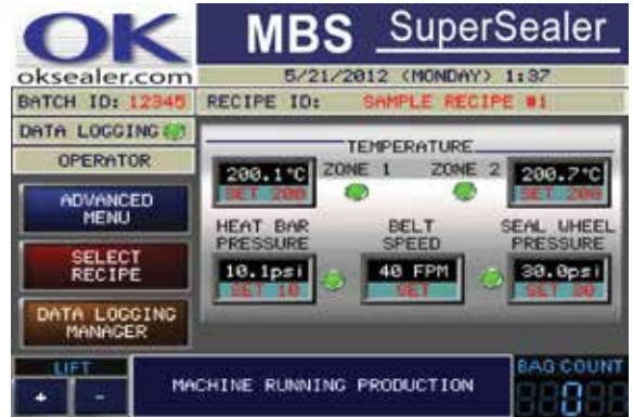
Touch screen operator interface for easy system and control monitoring.