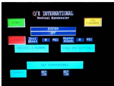
Touch Screen operator interface for easy system control and monitoring